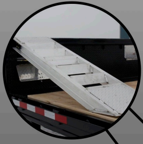
Manual front ramps.

MANY OPTIONS AVAILABLE IDEAL FOR RANGE OF JOBS - PAVING EQUIPMENT, RECOVERY VEHICLES, FARM EQUIPMENT COMPETITIVELY PRICED