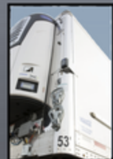
STAINLESS STEEL RADIUS CORNERS WITH FRUIT DOOR