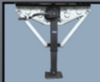
GALVANIZED STEEL LANDING GEAR MOUNTING PLATE & BRACING