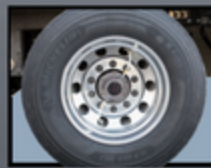
OPTIONAL TIRE INFLATION