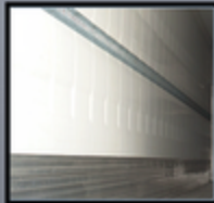
18" ALUMINUM SCUFF & E-TRACK