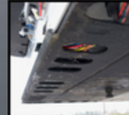
HEAVY DUTY 5/16" UPPER COUPLER PLATE