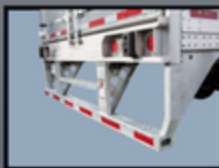
TOUGH GUARD BOLT-ON GALVANIZED REAR BUMPER