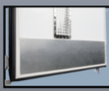
12" ALUMINUM SCUFF BAND