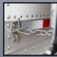
PATENTED LASH DOOR HOLD BACKS