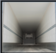
VOID-FREE FOAM PROCESS

Independent third party testing found Vanguard CIMC Reefers to be up to 15% more thermally efficient than leading competitors.