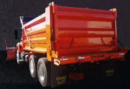
ANY OTHER CONFIGURATION