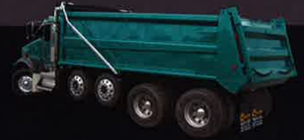
TAPERED HORIZONTAL SIDE BRACE